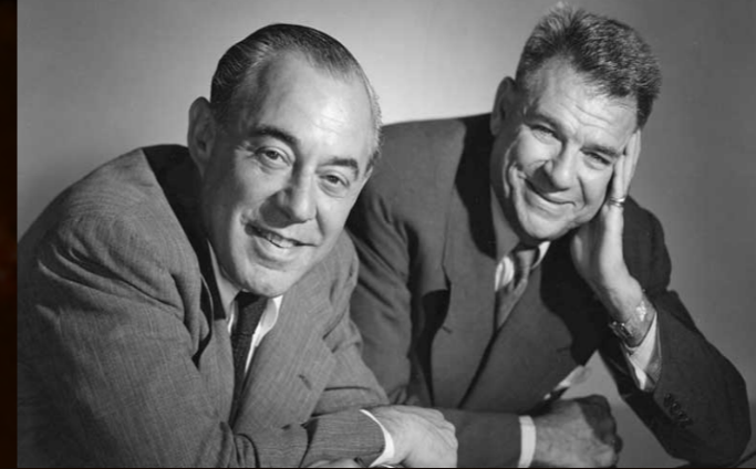
Richard Rodgers and Oscar Hammerstein

challenging lines or simply removing Billy's opportunity for redemption. All musicals age as times and attitudes change, but they are still stories, wanting to be told. The challenge is to find ways of staging them that help to soften the edges without losing the core of the story.